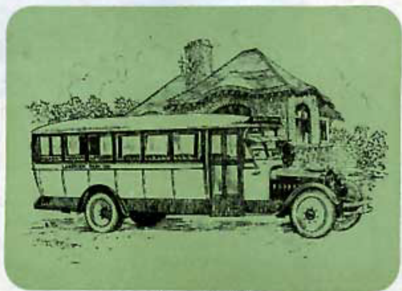
A BEAVER LAKE BUS