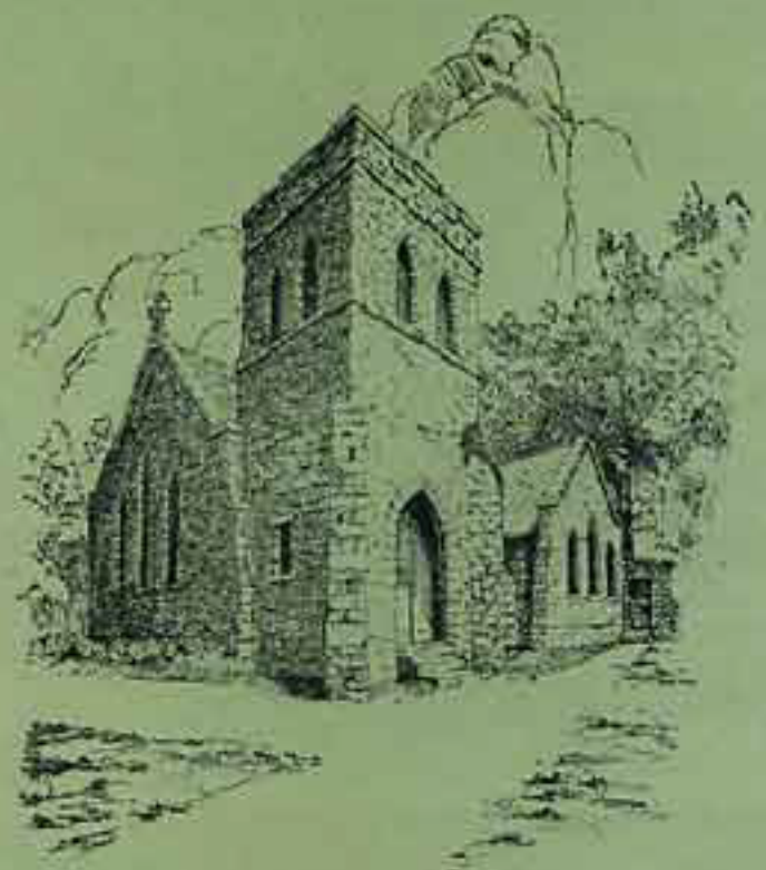
GRACE EPISCOPAL CHURCH

LAKE VIEW PARK ASHEVILLE, NC A COMMUNITY - OWNED PROJECT BY CLEARED.