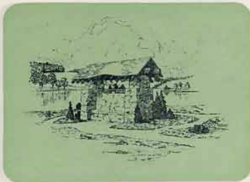
THE STONE SEAT AND THE LAKE

I N a region whose terrestrial formation contains no geological faults, upthrust masses of rock, natural depressions or cavities, nor ancient craters to fill, a lake is a rare object to find and a joyful vision to behold.