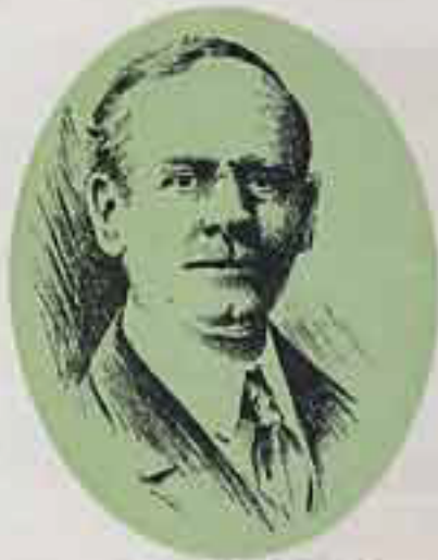
JOHN NOLEN Greatest City-Planner

IT is a logical presumption that anyone who would employ a Rubens has a fair subject to paint. And by the same thought, those who enlist the pre-eminent services of John Nolen may be assumed to have a sublime place for this great artist-engineer to embellish and perfect to the uses of man's habitation.