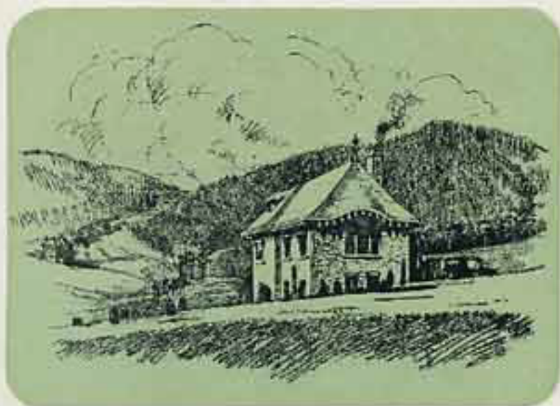
THE BEAVER LAKE OFFICE

Beaver Lake derives its larger value from a trinity of major factors which are thus very briefly summarized: