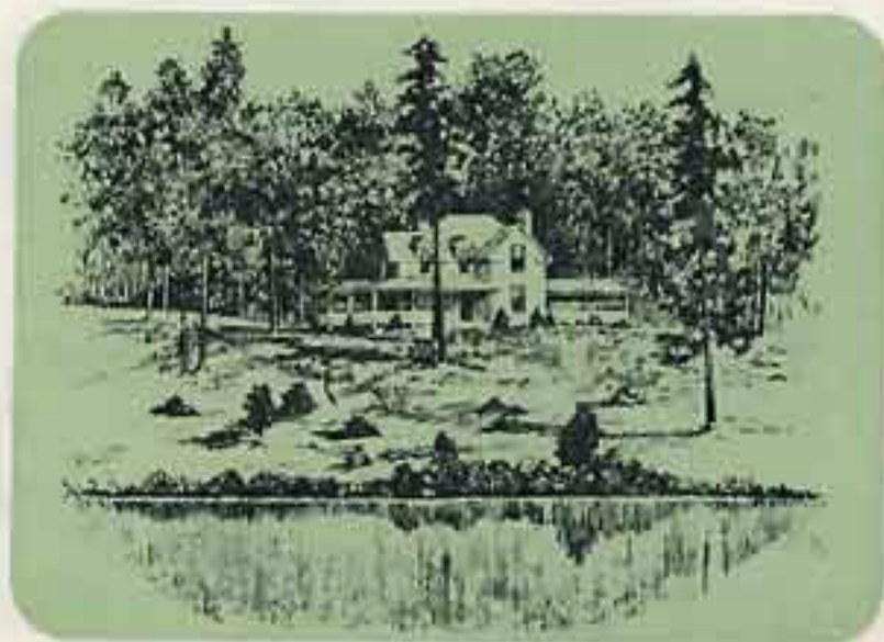
THE TEA HOUSE AT BEAVER LAKE