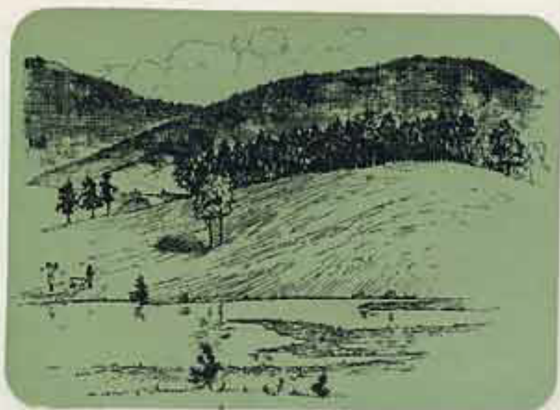
THE BEAVER LAKE GOLF COURSE