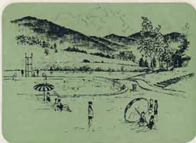
A SKETCH OF THE SWIMMING POOL

F ILTERED and germ-free water for swimming is a luxury usually confined to indoor pools in the larger clubs.